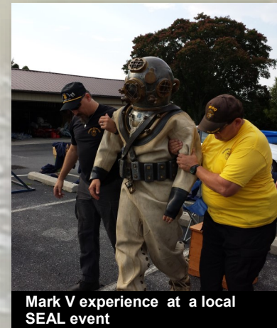
Mark V experience at a local SEAL event

TDU is 100% volunteer staffed and training is provided. No prior experience required. To find out more, contact: membership@tdu.net