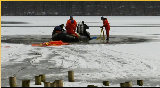
Divers and Dive Tenders prepare for search