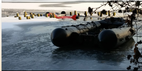
Vehicle recovery using underwater lift bags

"Without the knowledge and expertise of your unit; I do not believe we would have a resolution to this incident and closure for the victim's family"