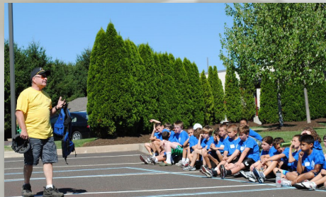
Dive member educating camp attendees on water safety