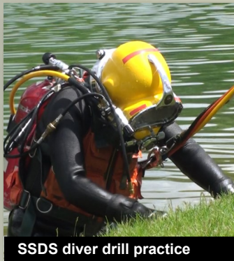
SSDS diver drill practice